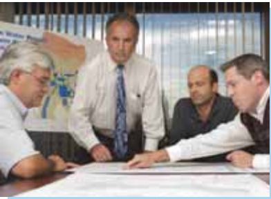
The Clean Water Project design team has studied hundreds of miles of sewers to determine how to best improve the system.